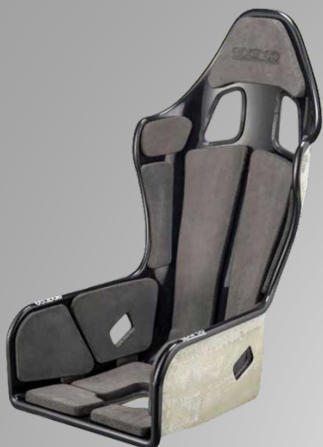
Seat: Sparco NEO