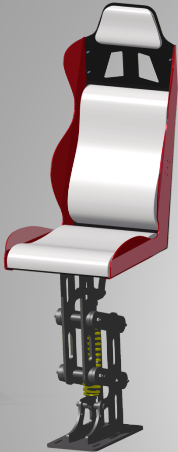
Spartan II Ver PL