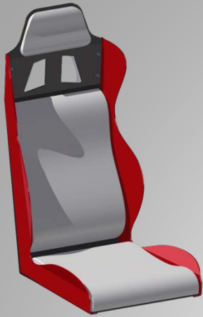
Seat: Spartan II